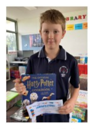
As part of the fair we also had the opportunity to give out a prize for each class. Congratulations to our 3 winners!