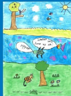
Rose's winning poster from 2023

Upload entries online by 5pm Friday 6 September 2024.